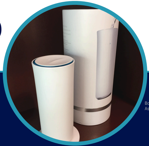
Box Build Assembly