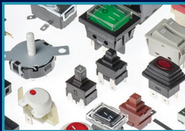
Zigbee Wall Switch