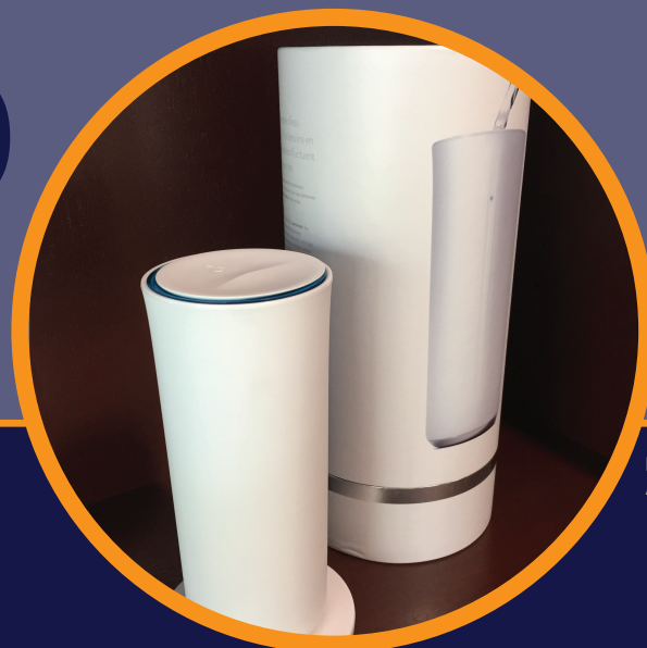
Box Build Assembly