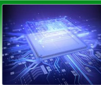
PRINTED CIRCUIT BOARD (PCB) ASSEMBLY SERVICES