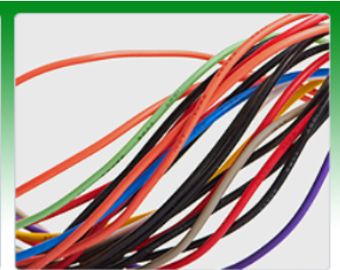
CABLE & WIRE HARNESS ASSEMBLY SERVICES