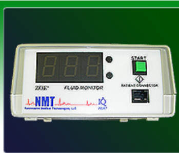
ELECTROMECHANICAL SYSTEMS/BOX BUILDING